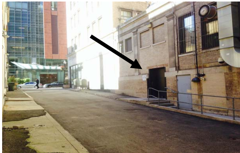
Loading Via Freight Elevator off Province Street