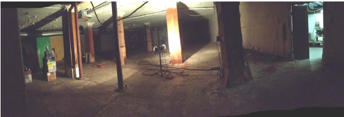
Unit 6, Ceilings: 7' -9" to 10'