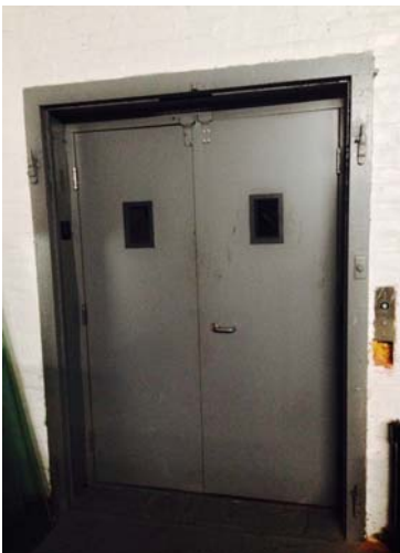
Freight Elevator, 5' opening