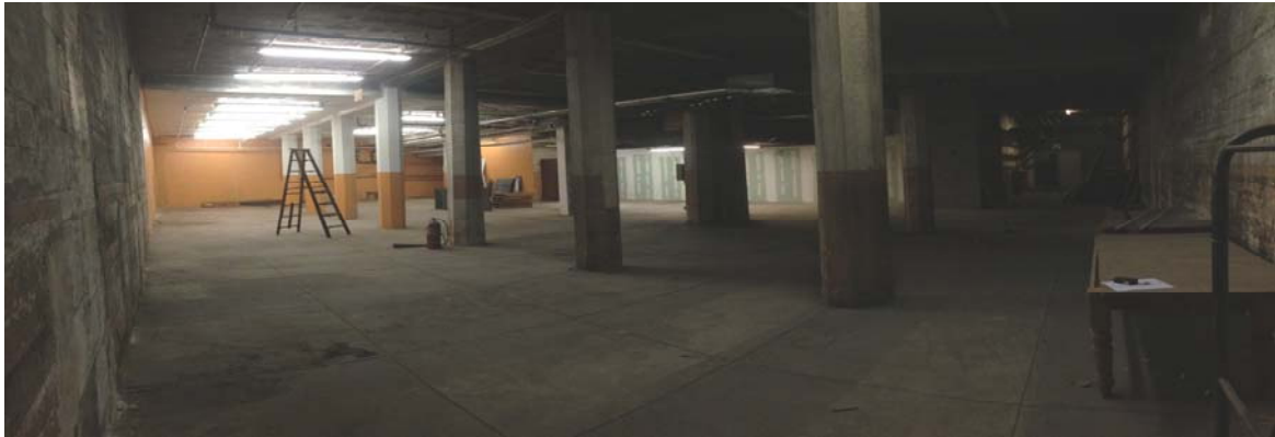
Unit 12, Ceilings: 11' -8" to 13' -2"