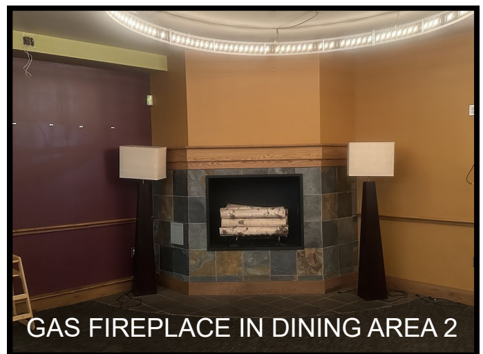
GAS FIREPLACE IN DINING AREA 2