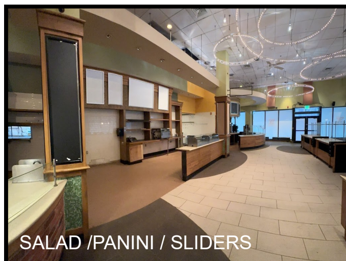
SALAD / PANINI / SLIDERS