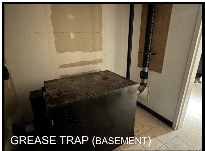
GREASE TRAP (BASEMENT)