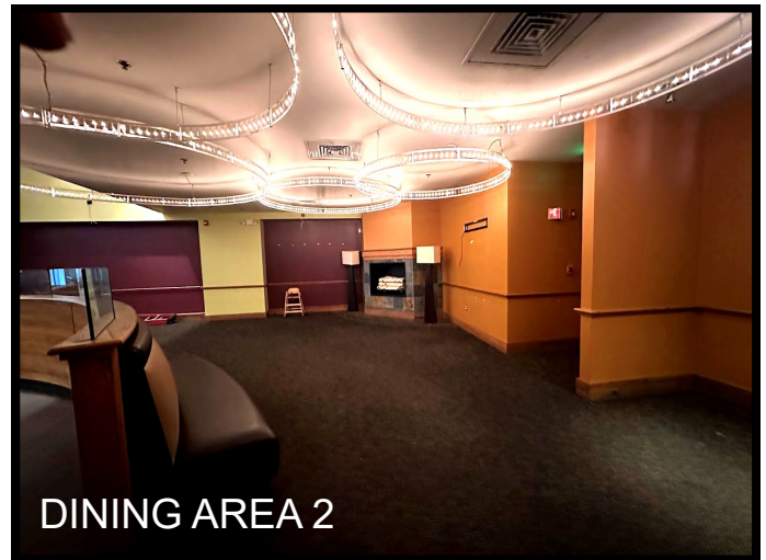
DINING AREA 2