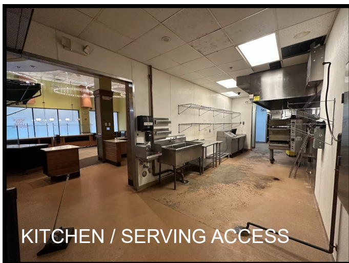
KITCHEN / SERVING ACCESS