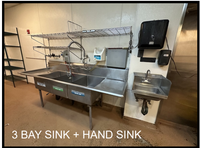
3 BAY SINK + HAND SINK