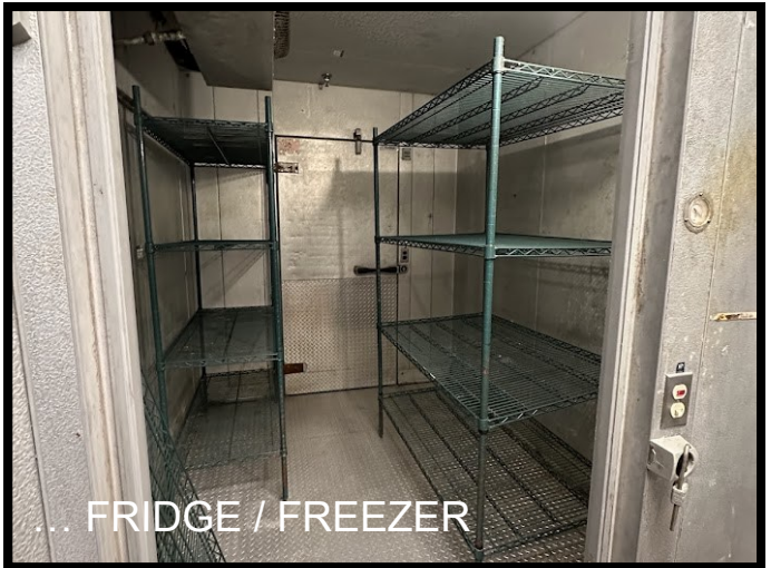
... FRIDGE / FREEZER