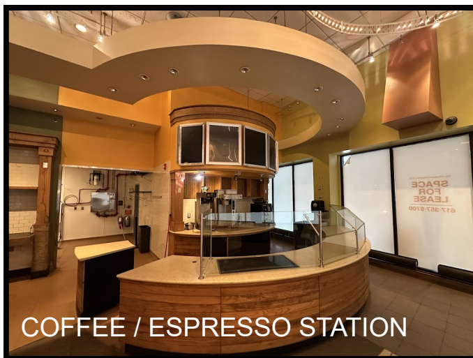
COFFEE / ESPRESSO STATION