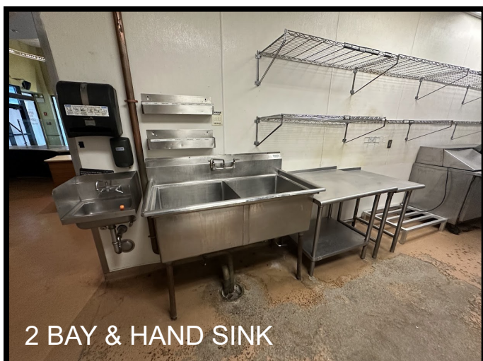
2 BAY & HAND SINK