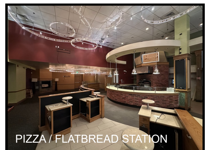
PIZZA / FLATBREAD STATION