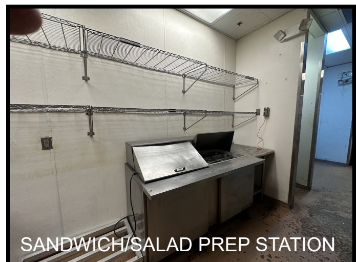
SANDWICH/SALAD PREP STATION