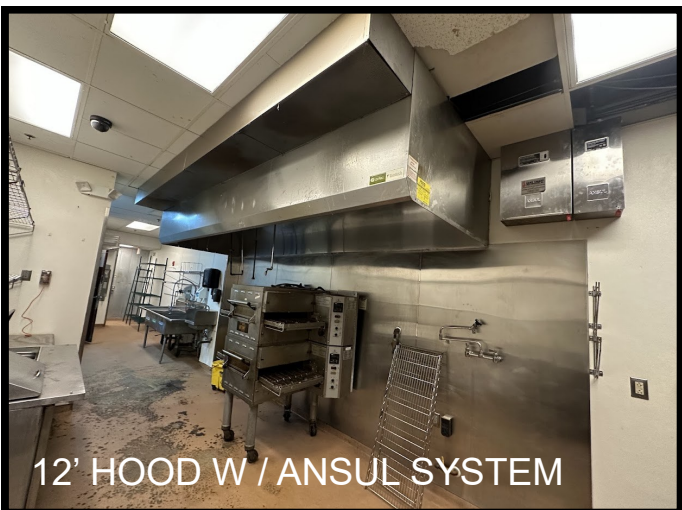
12' HOOD W / ANSUL SYSTEM