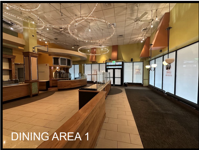
DINING AREA 1