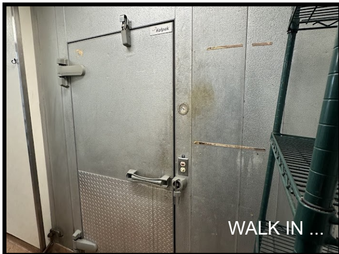
WALK IN ...